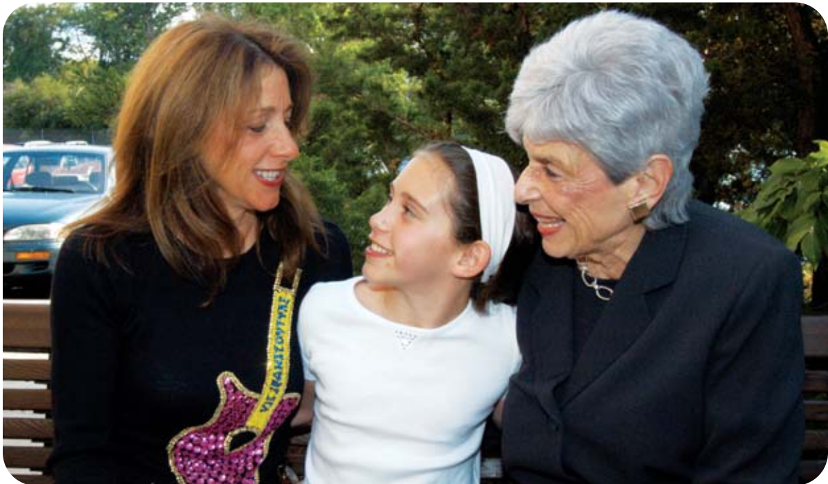
Family and friends can help support you.