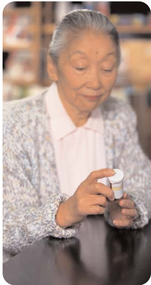
Some medications can help with memory problems.

See page 15 to learn where you and your family can go for help and information.