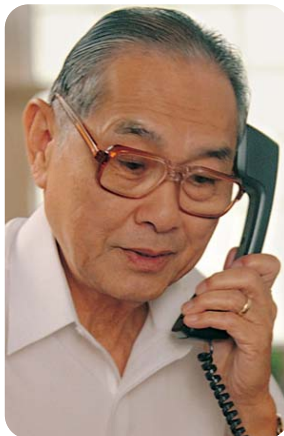
Call for more information.

Families often need information about community resources, such as home care, adult day care, and nursing homes. Contact the Eldercare Locator to find these resources in your area. The Eldercare Locator is a service of the Administration on Aging. It is funded by the Federal Government.