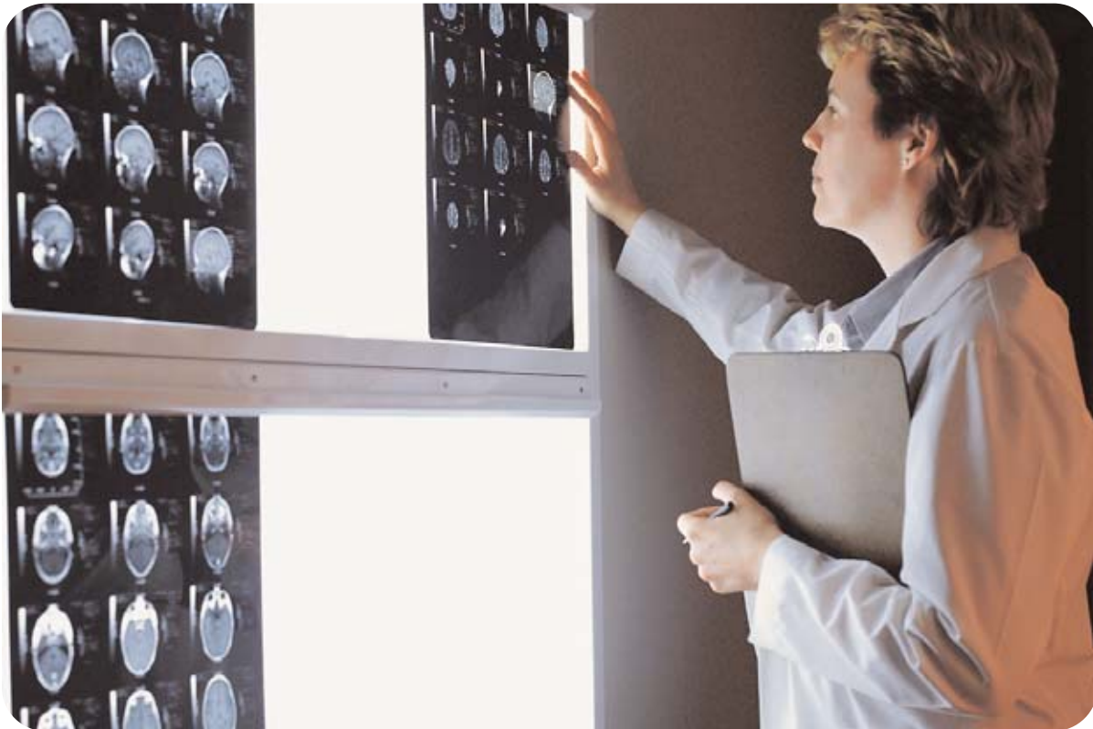
Doctors can check for some causes of memory problems using CAT scans.

See your doctor. If your doctor thinks it's serious, you may need to have a complete checkup, including blood and urine tests. You also may need to take tests that check your memory, problem solving, counting, and language skills. In addition, you may need a CAT scan of the brain. These pictures can show normal and problem areas in the brain. Once the doctor finds out what is causing your memory problems, ask about what is the best treatment for you.